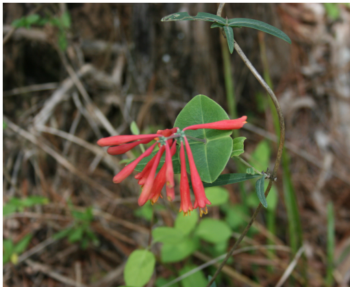
Native honeysuckle (Lonicera sempervirens)