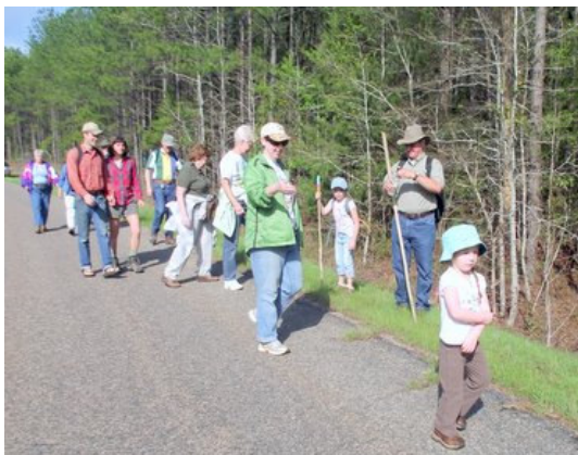
Group entering the Heritage Preserve